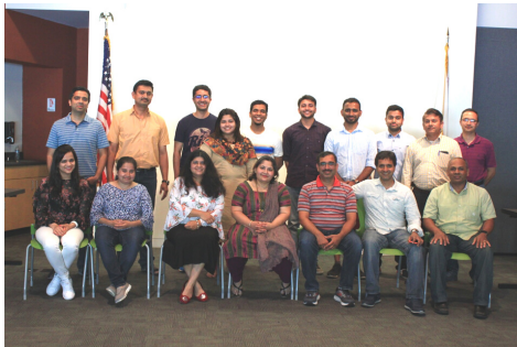
San Francisco Bay Area

Regional chapters organized in-person and virtual meetups in the past 15 months on various occasions. These include in-person meets in San Francisco Bay Area, Chicago, Seattle, New York, Boston, Greater Raleigh Area, Berlin, Sydney, Dubai, and Pune. Additionally, JP-South chapter twice organized virtual meetups. Over 125 members attended these events.